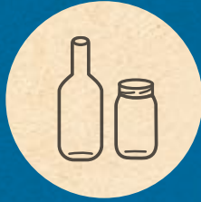
Glass and Jars