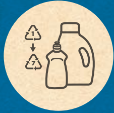
Plastic Containers (look on bottom for #1 -7)