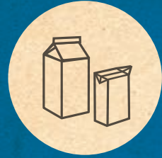
Milk & Drink Cartons