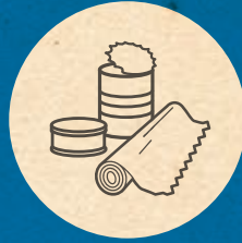
Aluminum Foil, Trays, Pie Plates and Tin Cans